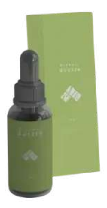
CBD Massage Oil Packaging